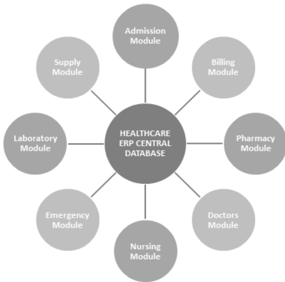
Fig. 2 Healthcare ERP Central Database

These modules share the same database, which allows connectivity between integrated health services that share information for different purposes.